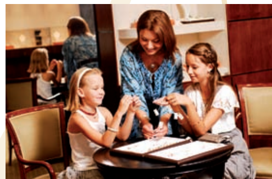
Good taste is acquired early.

Otrada Luxury Group realizes the important role customer service plays in building and maintaining brand loyalty and therefore works to keep employee turnover low by providing competitive compensation and benefits, superior training and a culture of caring for its employees.